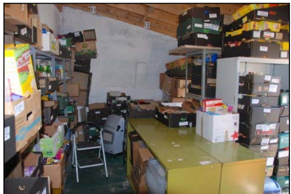
Our store as it was, a higgledy-piggledy mess and it's not even harvest time!

Thanks to Norman Family Trust and others for their generous donations we were able to purchase some new shelving for our store. The changeover operation took place on the 10 th of April with a handful of willing volunteers. They emptied the store weighing everything out for audit purposes, took down the old shelving, put up the new shelving and returned the food in a better order onto the new shelves.