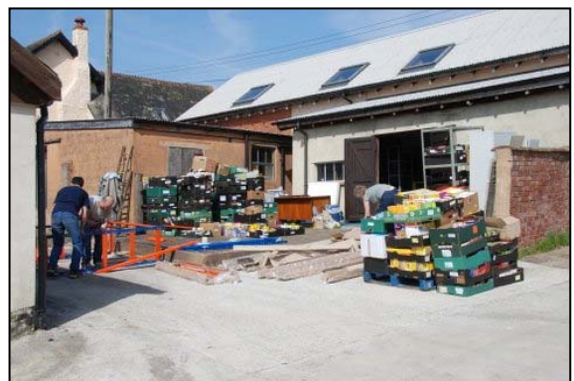
Everything out and new shelving being made ready.

This will make such a difference to us as it gives us more room to store food and hopefully not have to step over lots of boxes just to get a tin. Last harvest time we had so much food that it filled the work areas and it took ages to sort the food we got. Hopefully now we are better prepared and better able to cope with large volumes of food.