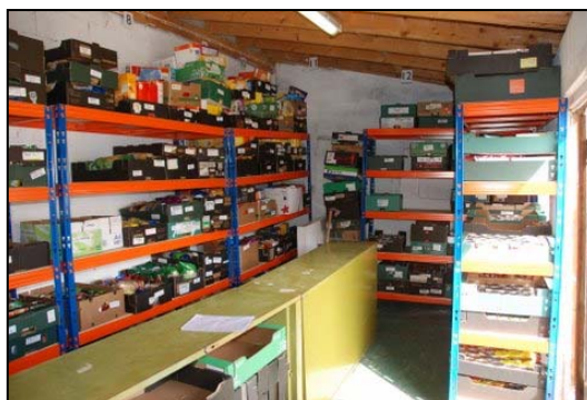
Finally - order from chaos.

Thank you to all those who volunteered that day and have made a real difference to our operation.